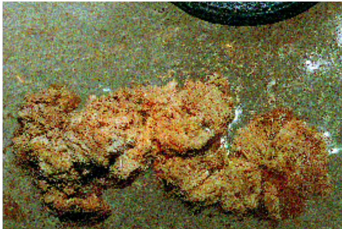
Figure 6. Small concretion of needle-like gypsum crystals exposed by the shrinking of a cave ice body.