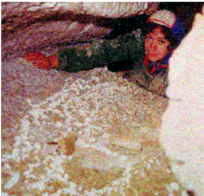
Figure 2. Concretions of gypsum powder in Ledyanaya Volna Cave. The second author provides scale.

If removed by a powerful flood, the gypsum powder can become a principal part of gypsum "foam" (which also includes some clay and organic matter) deposited on shelves and on the banks of streams. The thickness of this foam can