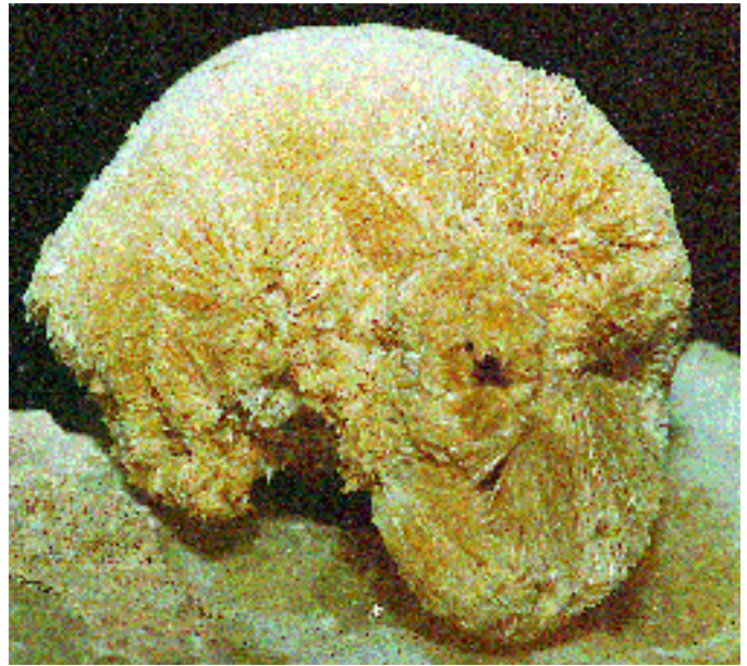
Figure 5. Another type of gypsum yozh that appears to have grown inside of a cave ice body.

It is necessary to note that the sheaf type of splitting is not typical for gypsum and is not described in common reference books, so it is impossible to strictly estimate the degree of supersaturation. However, based on the shape of the crystals and not taking into account splitting (which is not so evident), it is possible to suppose a degree of supersaturation near 2-3 times, lower than for the first type of yozh, and close to that of needle-like unsplit crystals.