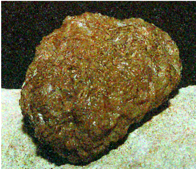
Figure 4. Gypsum yozh that has grown inside of frozen clay.

tributed in thick clay sediment. Normally 2-4 cm but up to 10 cm in diameter. These clearly are the purest kind and almost always have a little cavity inside (1-4 cm, up to 15 mm), sometimes with a stone in the cavity that rattles when shaken. The degree of splitting varies widely and, based upon its distribution in these caves, is probably controlled by supersaturation (Russo 1981) (i.e. by the velocity of freezing, Fig. 4).