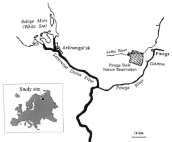
Figure 1. Sketch map of the Arkhangel'sk Region of the Russian European North.

The most diverse and plentiful speleothems in these caves are made of ice. Perfectly transparent ice crusts cover hundreds of meters of underground lakes overgrown with "bamboo" stalagmites. Ice crystals of both winter and summer gen-