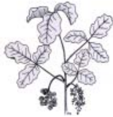
Toxicodendron diversilobum WESTERN POISON OAK