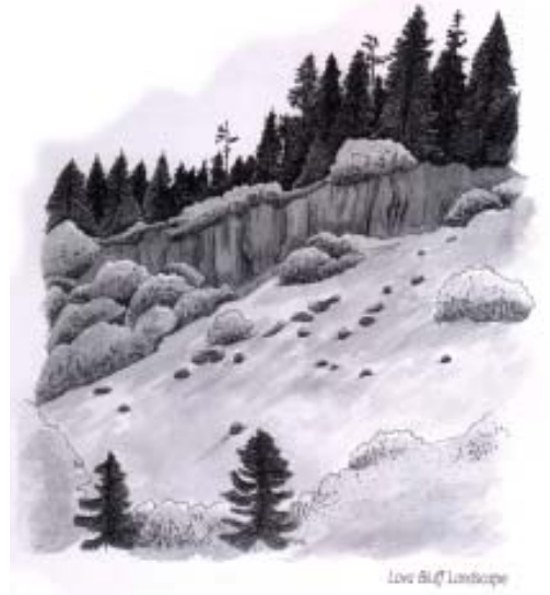
View from the Lava Bluffs Trail at Calaveras Big Trees State Park. Illustration by Peg Edwards.