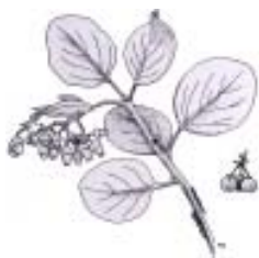
Arctostaphylos patula GREENLEAF MANZANITA