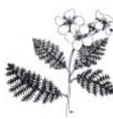
Chamaebatia foliolosa MOUNTAIN MISERY