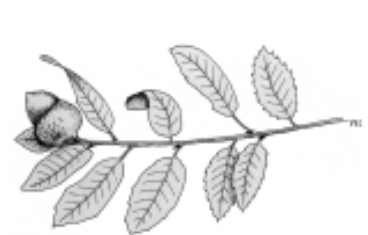
Quercus chrysolepis CANYON LIVE OAK