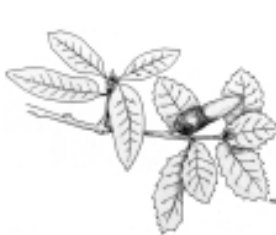
Quercus wislizenii INTERIOR LIVE OAK