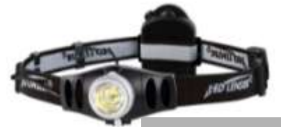
LED Lenser H7

using a new light that was profiled in the January 2011 National Speleological Society News, the Coastal LED Lenser H7. The light put out 172 lumens and was very bright. Everyone proceeded to the breakdown prior to the big ball room. Brett proceeded to the front of me, but missed the climb up. As Marion and I climbed up into the big room