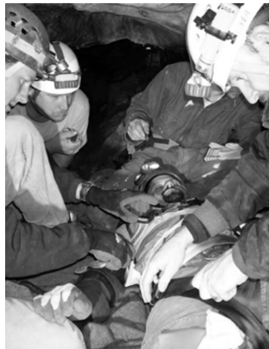
Students practice patient packaging during an OCR mock rescue.

We will try to end Sunday's mock rescue and debriefing by 4pm for student travel considerations.